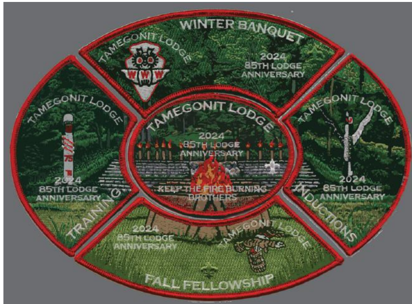
Event Calendar and Registration

Mark your calendars and register for Lodge Events! Our 2024 Lodge Calendar is now available. Registration is open for all 2024 Inductions.