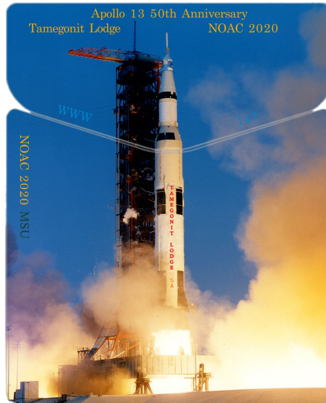
2020 NOAC Delegate Patch

To prepare for the 2020 NOAC, our Lodge Executive Committee voted to make 4 patch designs. Each set is made for a specific reason. We have patches for fundraising, the contingent, and trading. The Moon Patch is $20 and will start being sold by the beginning of August. The delegate patch is a Rocket Launch (below) and will be given to those who pay their $100 deposit. You can pay your $100 deposit for NOAC at 2020 NOAC .