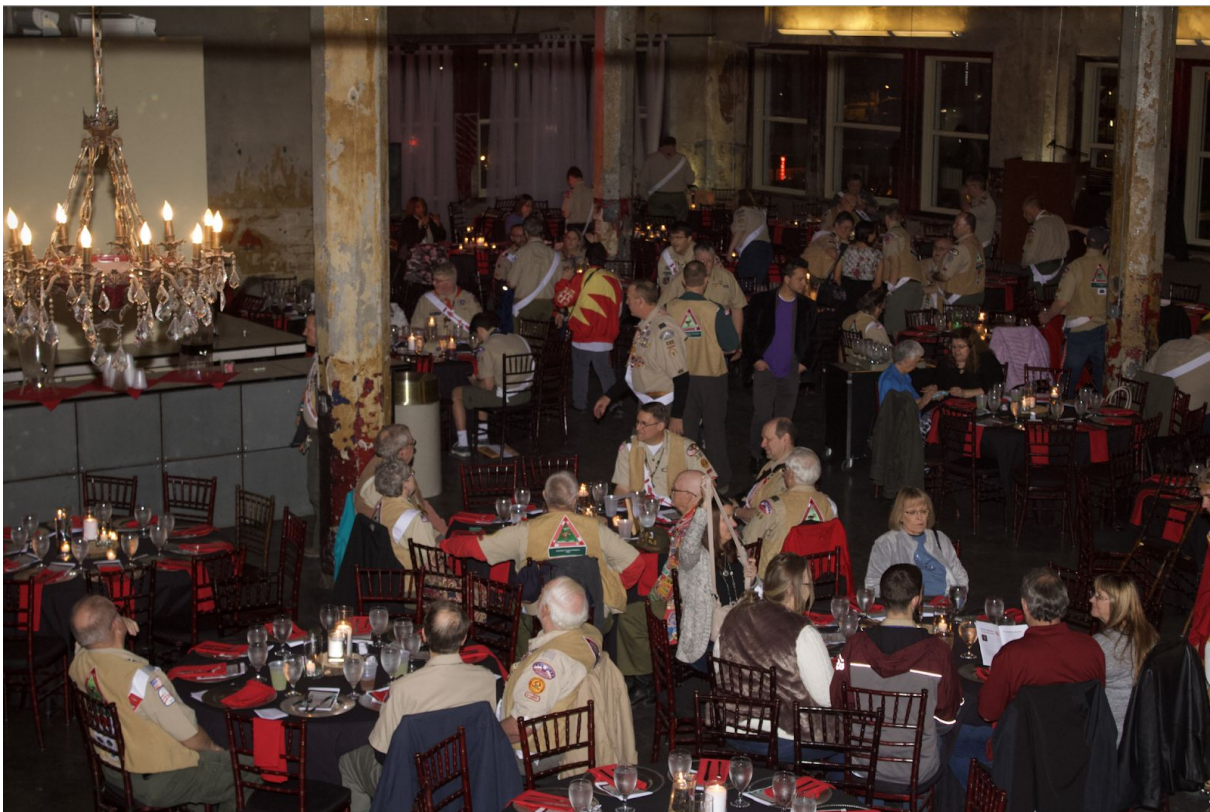
2019 Winter Banquet